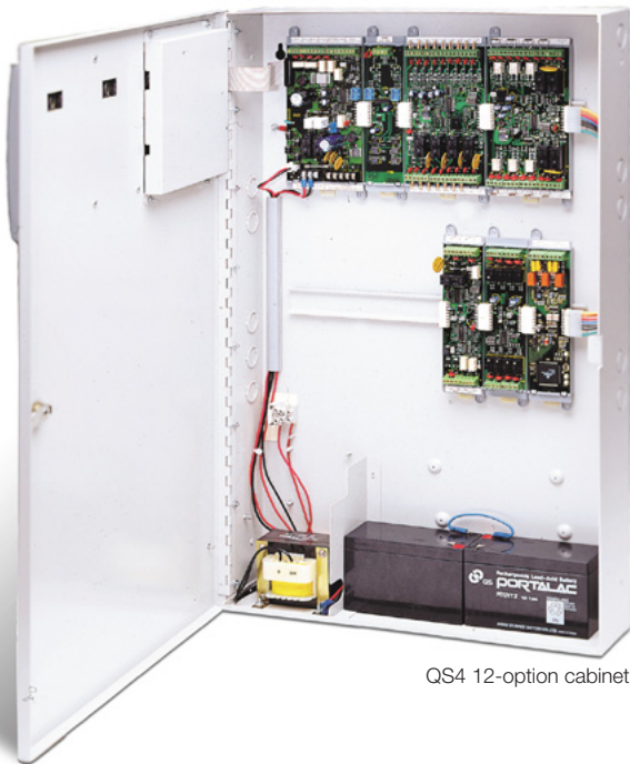
QS4 12-option cabinet

All QuickStart packages include a cabinet, power supply, CPU, display, and 115v transformer. QS1 single loop panels come standard with an SLIC loop controller. QuickStart option cards provide a wide range of features and extra system capacity. Thanks to the convenient Quick-Lock mounting system, option cards snap onto the DIN mounting rails easily and securely. The hybrid multiple loop QS4 and the Conventional QSC control panels are available with enclosures for either 5- or 12-option cards.