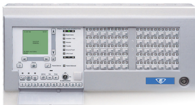
QuickStart's contoured CPU/Display Unit houses the panel's CPU card and mounting space for optional LED/Switch cards. These are used for point/zone annunciation and control.

rest of the building. There's no big installation charge either. With single-button programming and no internal wiring to do, QuickStart panels are configured and installed pronto.